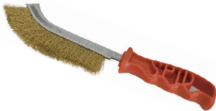
Panini Grill Cleaning Brush